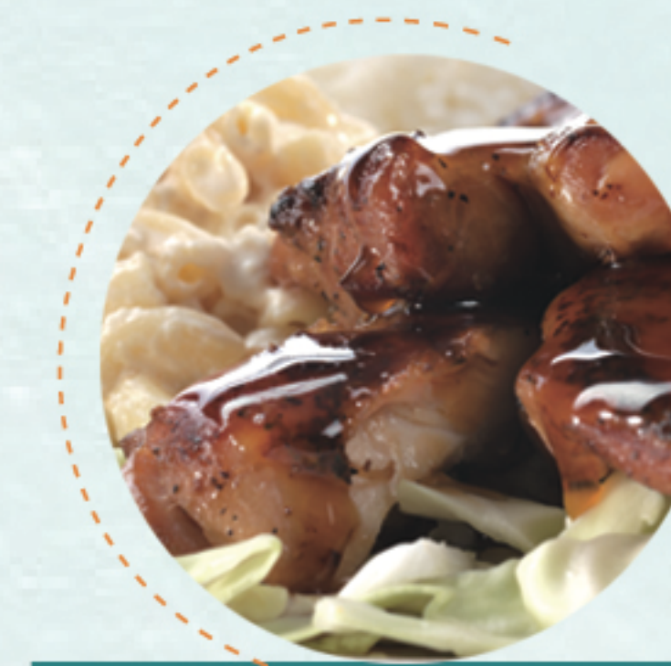
Island Fire Chicken