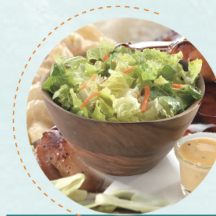
Fresh Mix Salad