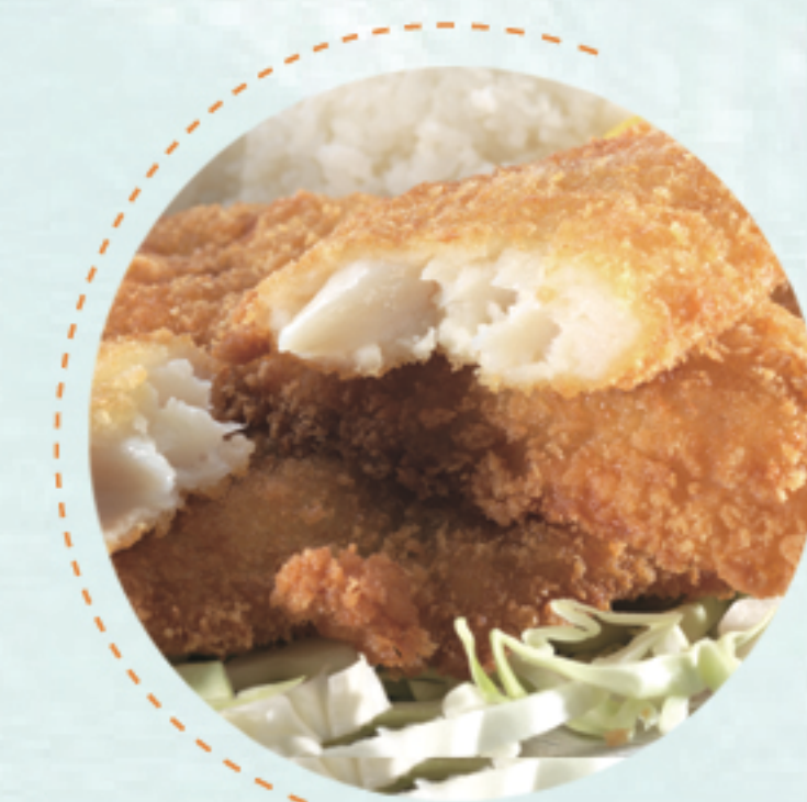
Island White Fish