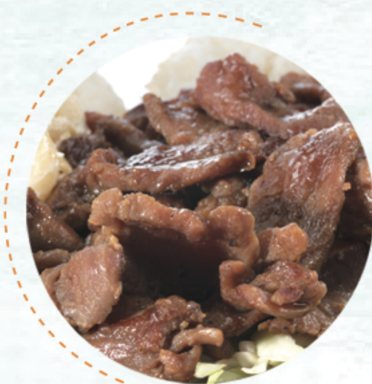
Hawaiian BBQ Beef